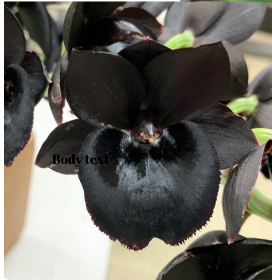
Ctmds. Darkonium 'Ebony Beauty' FCC/AOS