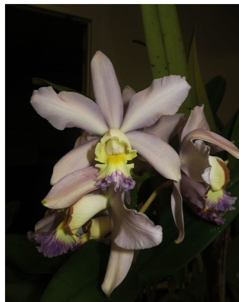
Carl Wood's Lc. Lake Tahoe v. coerulea x C. loddigesii v.