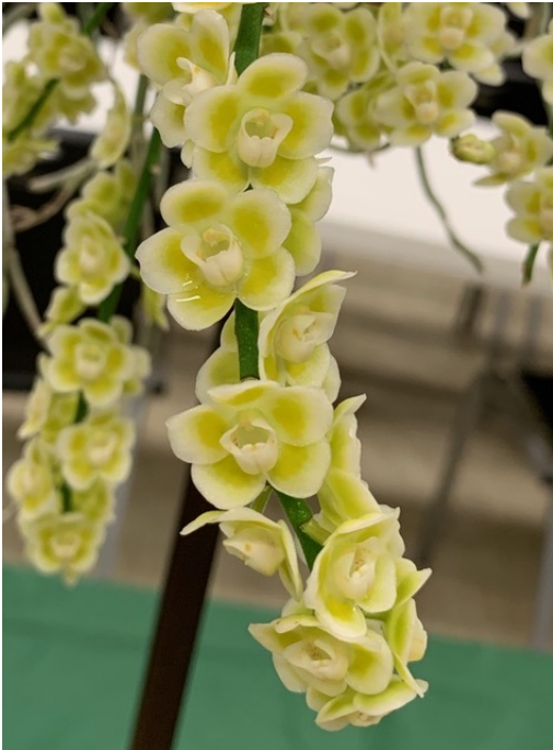
Chiloschista viridiflava 'Arnie' AM/AOS