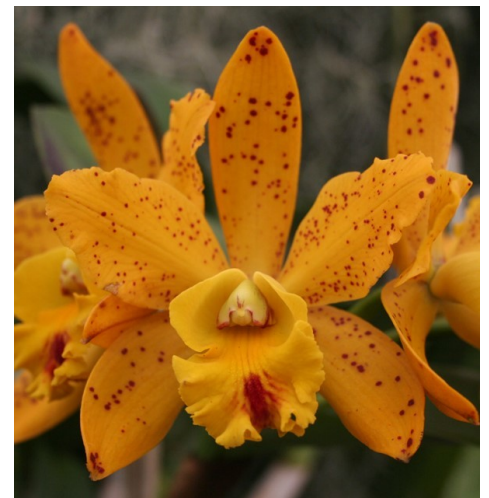
C. Beaufort x C. Landate