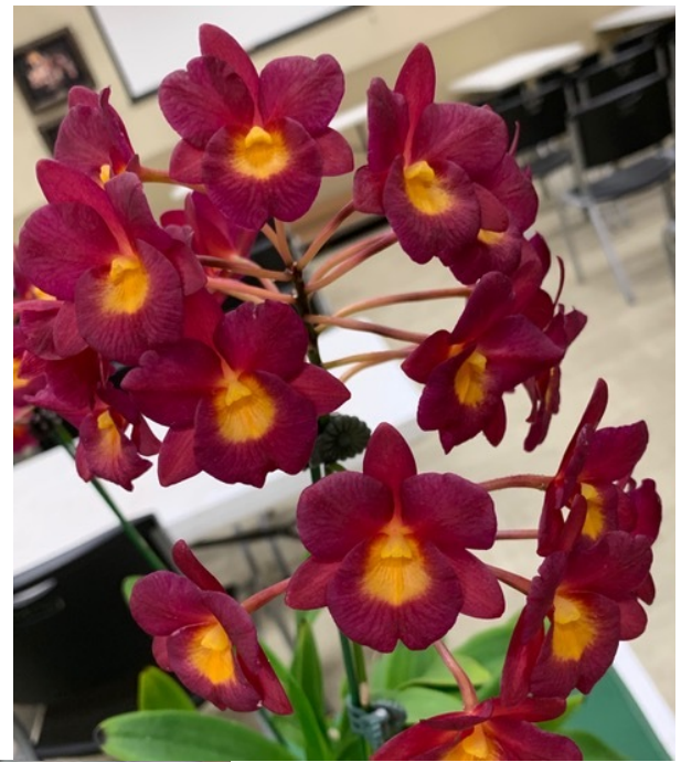
Guaritionia Why Not? 'Feuerbach'